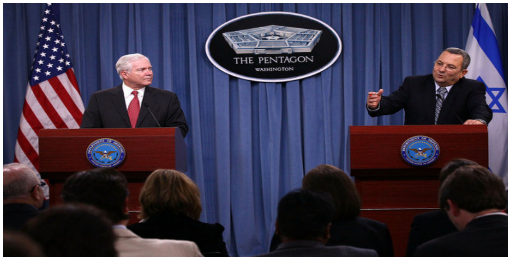
Robert Gates and Israel's Minister of Defense Ehud Barak, Press Conference, April 27, 2010

Obama promised that no decision taken during the recent 189-nation conference to review and strengthen the 40-year-old Nuclear Non-proliferation Treaty "would be allowed to harm Israel's vital interests," the sources said. Obama promised to bolster Israel's strategic capabilities, Jerusalem officials say - Haaretz Daily Newspaper )